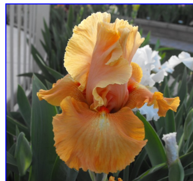
Come Go With Me