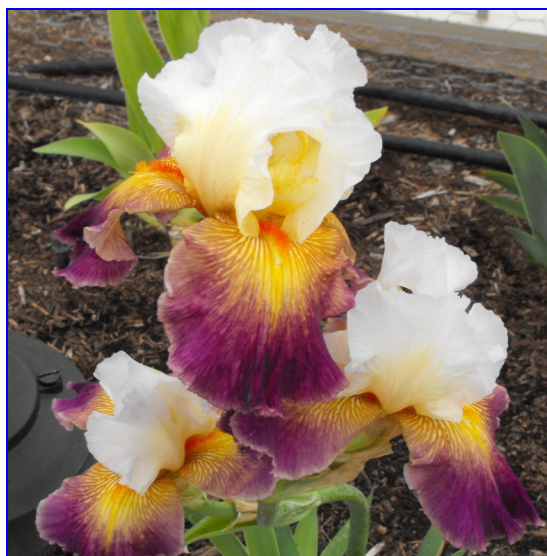
Like a Rainbow